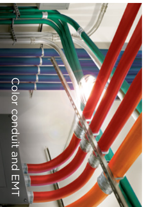
Color conduit and EMT