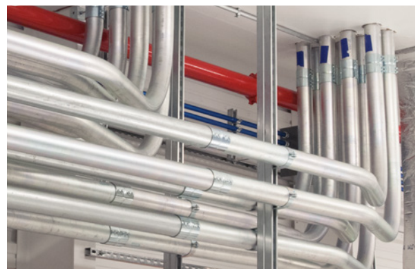
20' EMT, exclusively from Wheatland Tube.

To learn about using 20' EMT on your next project, contact Wheatland at 800.257.8182