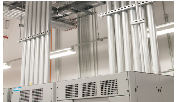
20' EMT installs straight for easy equipment hookups.